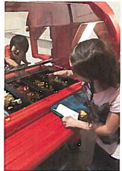
Second graders help themselves to fruits and vegetables.